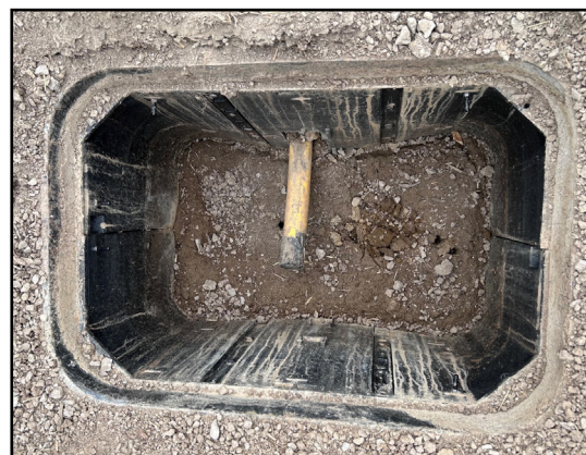
Handhold installed at The Jobsite